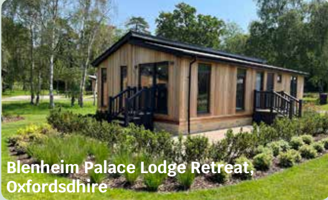
Blenheim Palace Lodge Retreat, Oxfordshire