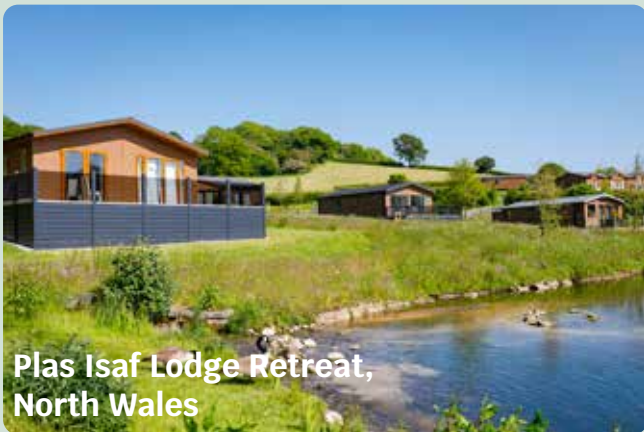
Plas Isaf Lodge Retreat, North Wales