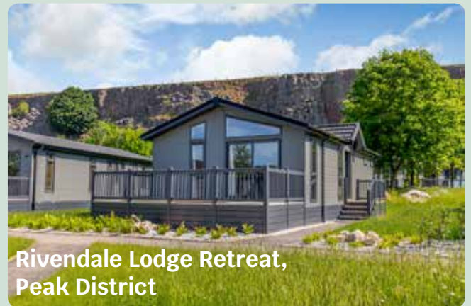
Rivendale Lodge Retreat, Peak District