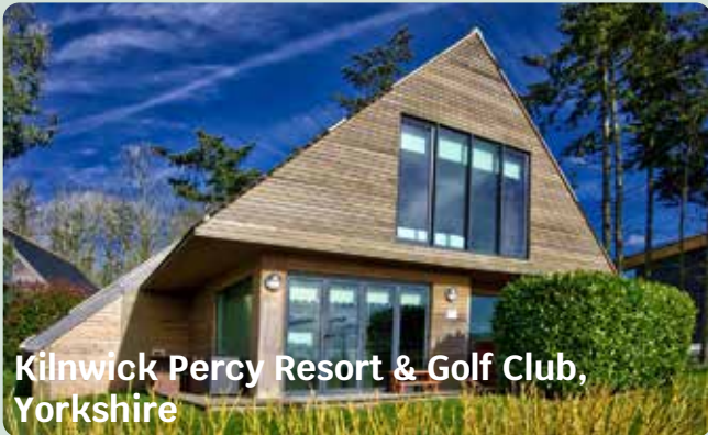
Kilwick Percy Resort & Golf Club, Yorkshire