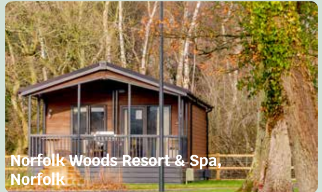
Norfolk Woods Resort & Spa, Norfolk