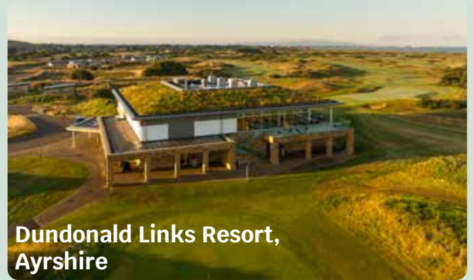
Dundonald Links Resort, Ayrshire