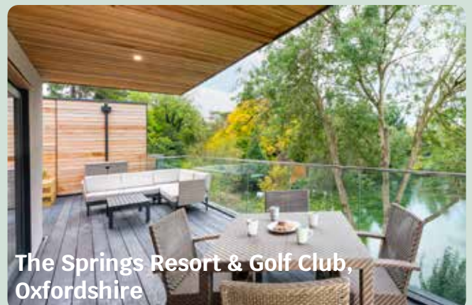
The Springs Resort & Golf Club, Oxfordshire