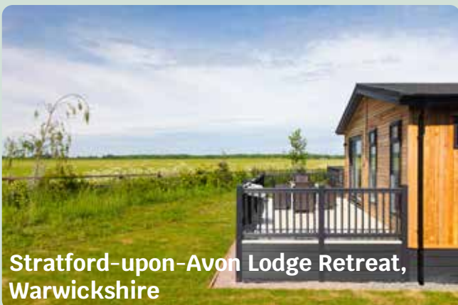
Stratford-upon-Avon Lodge Retreat, Warwickshire